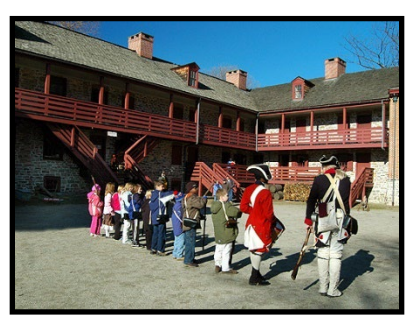
Heritage Sign Program

<u>Crossroads of the American Revolution</u> National Heritage Area was awarded $5,000 to create wayfinding and interpretive signage as part of their state-wide signage program.