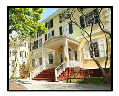
Reimagining Visitor Experiences <u>Liberty Hall Museum</u> was awarded $5,000 for the creation of a tour to attract new audiences.