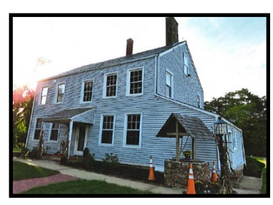
Historic Baird House

The <u>Friends of Millstone Township Historic Registered Properties</u> was awarded $5,000 to develop wayfinding signage.