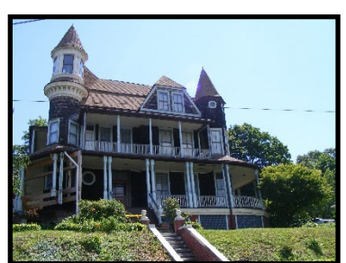
Atlantic Highlands Architecture Tours

The <u>Friends of Millstone Township Historic Registered Properties</u> was awarded $5,000 to develop wayfinding signage.