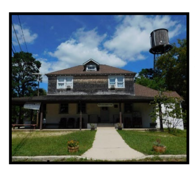
Cranberry History Trail

The Whitesbog Preservation Trust was awarded $5,000 to develop a cranberry history trail postcard linking active historic cranberry farm villages.